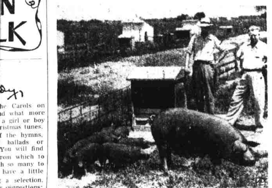
MAKING FARMERS CROSS—Landroc crossed sow, ready to cross.

LAFYETTE, Ind.—Hybrid hogs developed at the Purdue University experimental farms are showing farmers how to get more pork out of every porker.