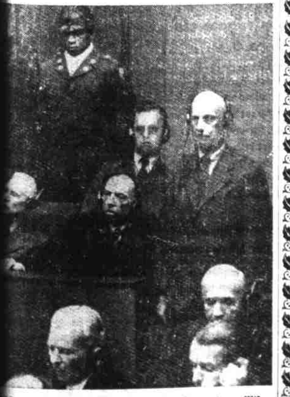
in American War Crimes court in Nuremberg, Wileld Marshal, who helped plan and carry out invasions Poland, the Low Countries and France, hears himself years in prison. Although drawing sentences of from mprisonment, thirteen top German commanders on of plotting to launch World War II.

From BELK'S 14 Big Departments Just Received ---With Unusual Savings New Shipment Of Wagons - Tricycles Air Rifles - Dolls WE WILL CASH YOUR TOBACCO CHECKS AT ANY Trains – Footballs