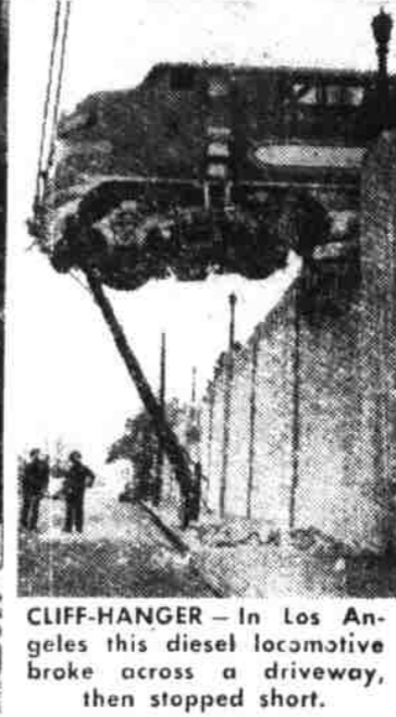
CLIFF-HANGER—In Los Angeles this diesel locomotive broke across a driveway, then stopped short.