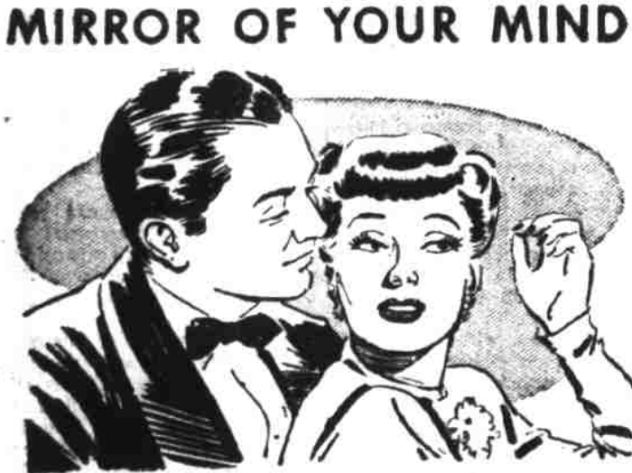
Will frustration end

In no way was the happiness and pleasures of the holiday season lessened but always underneath was the current of reverence and impressiveness. Perhaps that was the reason it was one of the very best we have ever al Editor, has referred to me what sters who are unable to go to tions change his way of living.