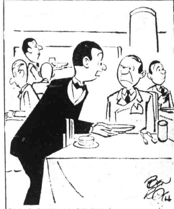
"You're right! It was diswater! The management regrets the error, sir!"