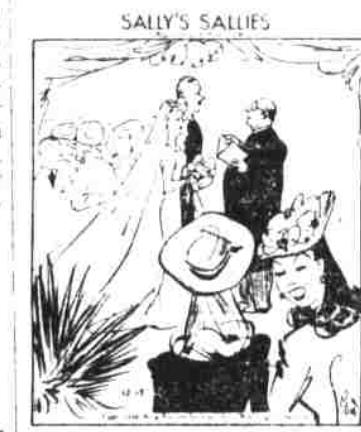
"He's losing a secretary but getting a cashier."