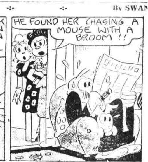
RIGHT ARO UND HOME