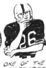
ONE OF THE SHARPEST PLAY CALLERS

was chosen the outstanding player in the Sugar Bowl classic as the Sooners defeated Carolina, 14-6.