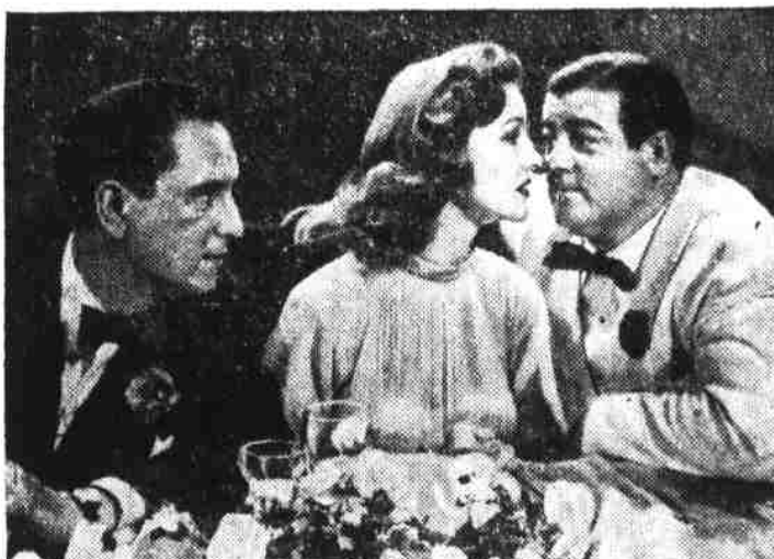
Lovely Virginia Grey operates on the "divide and conquer" principle, focusing her attention on comedian Lou Costello, while his perennial side-kick, Bud Abbott, looks on in disgust in a scene from Universal-International's mirthful musical, "Mexican Hayride", which opens at the Strand Theatre Sunday.