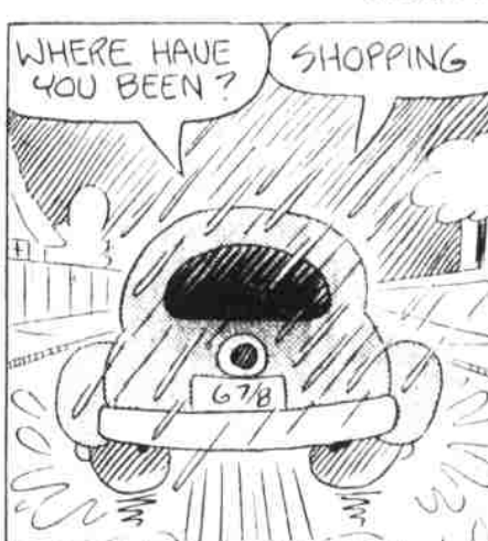
RIGHT AROUND HOME

IM SO GLAD YOU HAPPENED ALONG, DEAR-I'M SOAKED TO