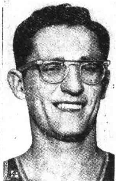
GEORGE MIKAN Wears Thick Glasses

Mikan has tried contact lenses, to get around wearing the cur-