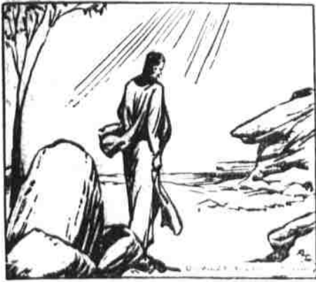
After His baptism, Jesus, being full of the Holy Spirit, left the Jordan and "was led by the Spirit into the wilderness," where He stayed for 40 days, fasting, and Satan came to Him.