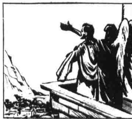
Taking the Lord to the pinnacle of the temple, Satan told Jesus to throw Himself off and God's angels would save Him, but again Jesus refused. MEMORY VERSE—Hebrews 4:14-15.