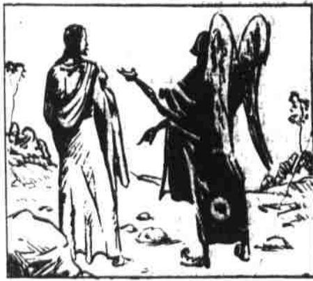
After many days in the wilderness Jesus grew hungry; then Satan tempted Him by saying that Jesus could turn the stones into bread to satisfy His hunger, but Jesus refused to do so.