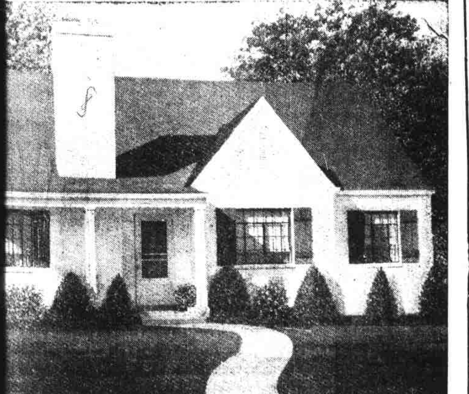
Plans used by permission Standard Homes Co.