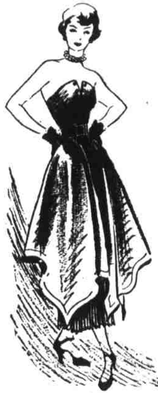
Strapless evening gown.