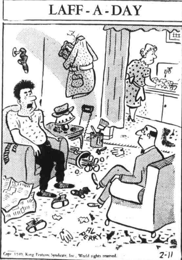
"She's a fine woman, but she's forever nagging me about something."