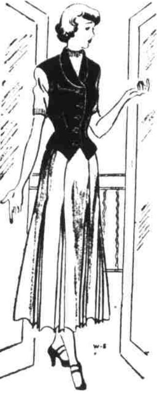
Pretty weskit suit.