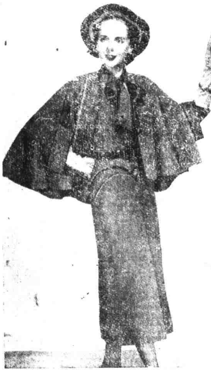
ENSEMBLE ... Suit and cape of gray flannel is a timely choice for spring. Brief fitted jacket is "petaled" in points above the pockets of the skirt. Cape is lined in red dotted sarah, to match blouse.