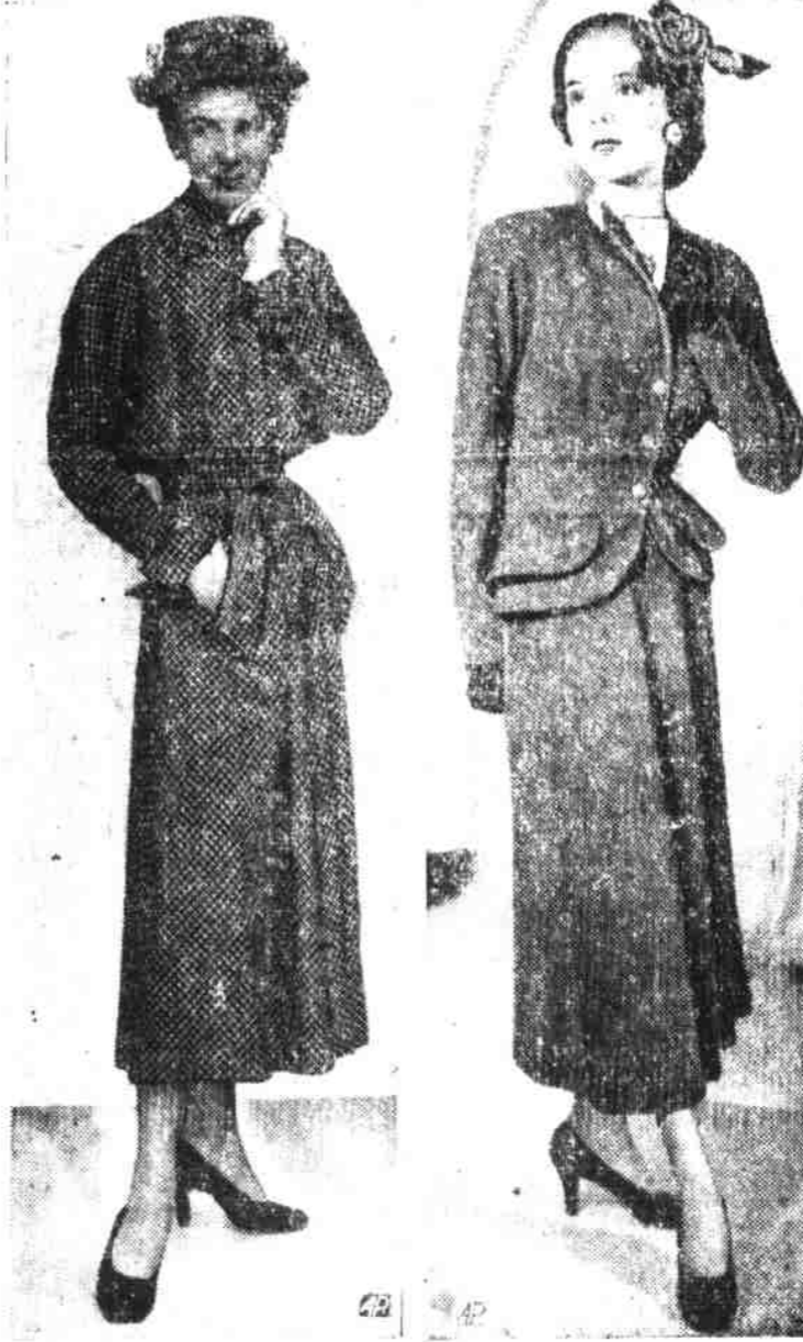
DRESSMAKER ENSEMBLE ... Jacket and dress in black and white checked wool. All-purpose outfit. ALL-OCCASION SUIT ... Subtly tailored suit in royal blue wool with pink shantung ascot and lining.