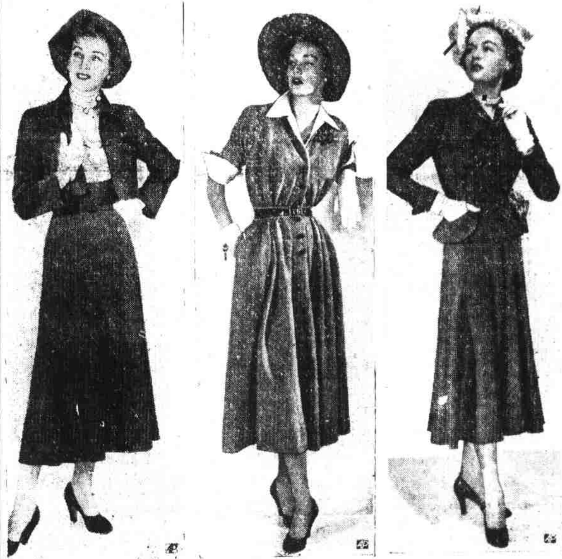
BOLERO COSTUME ... Another top '49 fashion in navy alpaca. Dress has a pink, short-sleeved top. SHIRTWAIST LOOK ... The indispensable casual one-piece dress in pinchecked wool, white pique. THE SILK SUIT ... New and right for spring—jacket and "ress" in navy dotted sarah, from New York.