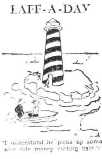
"I understand he picks up some nice side money cutting hair."

The witch-hazel tree bursts into bloom when other trees are shed, long their foliage and when its down leaves are yellow and falling.