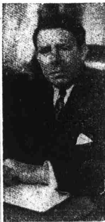
SENATOR J. M. BROUGHTON died early Sunday in a Naval Hospital, near Washington, of a heart attack. His untimely death cut short a Senate career begun only nine weeks ago.