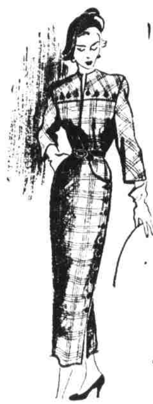
Flattering plaid outfit.