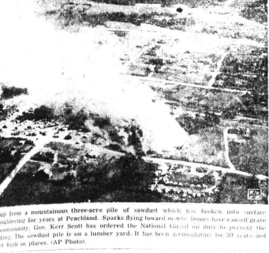
Up from a mountainous three-acre pile of sawdust which has broken into surface...