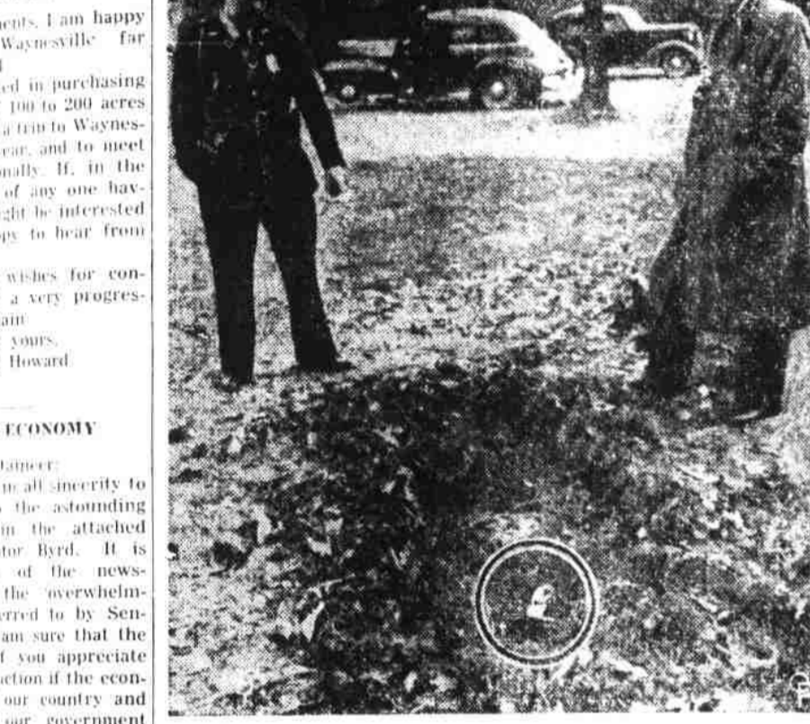
WHERE INFANT WAS BURIED ALIVE WITH ITS SLAIN MOTHER