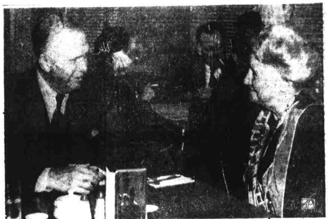
Gen. George C. Marshall, former secretary of state, and his wife dine informally at a restaurant in Sanford. The general is smiling and appears 35 and rested after his recent operation for a kidney ailment. They drove over from their vacation home, "Lacomb Lodge," at Pinhurst, 30 miles from Sanford.