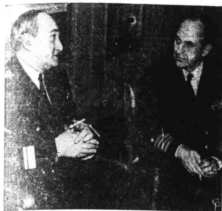
UNITED STATES NAVY Capt. Joseph U. Lademan, Jr., is shown with Rear Adm. E. G. Glinkov, naval attache of the Soviet Embassy in Washington, at the dinner party Navy men tendered in Lewes, Del. ...