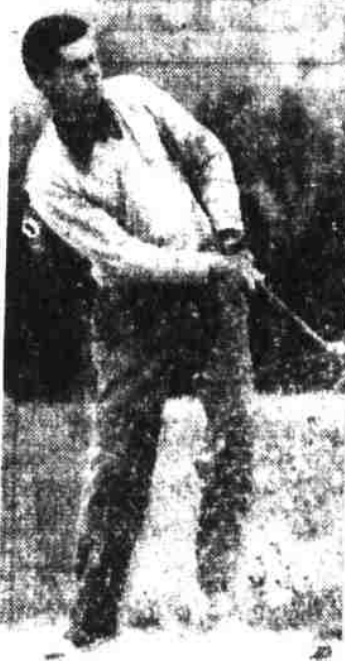
Cary Middlecoff, Memphis, Tenn., golfing dentist, is veteran Lloyd Mangrum's choice to take the Masters Tournament which opens Thursday at Augusta, Ga.