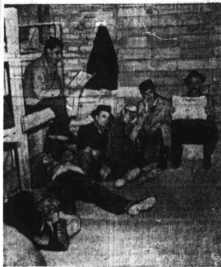
ITALIAN WORKERS in Rome read copies of "L'Unita," the Communist newspaper, as they practice their own version of the "sit-down" strike. Under leadership of the Red-controlled Confederation of Labor, the men move in and occupy a factory where any sizable number of workers are laid off and stay until the employer gives in.