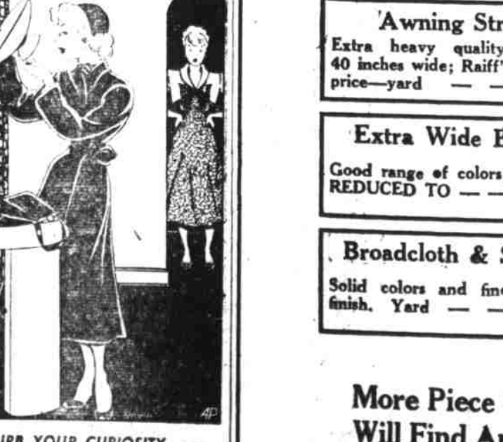
CURB YOUR CURIOSITY. Don't make an inspection tour of your hostess' house whenever you go visiting.

sick. Even weeks afterward, the slung part of your body smart when you wash.