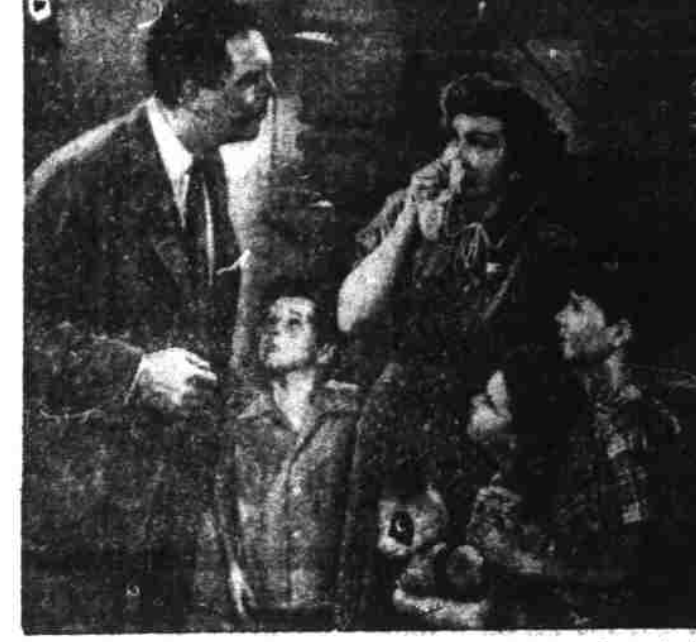
The "Egg & I" stars together again in one of the grandest of all comedie "FAMILY HONEYMOON" starring CLAUDETTE COL-BERT and FRED MacMURRAY opening at Strand Theatre Sunday