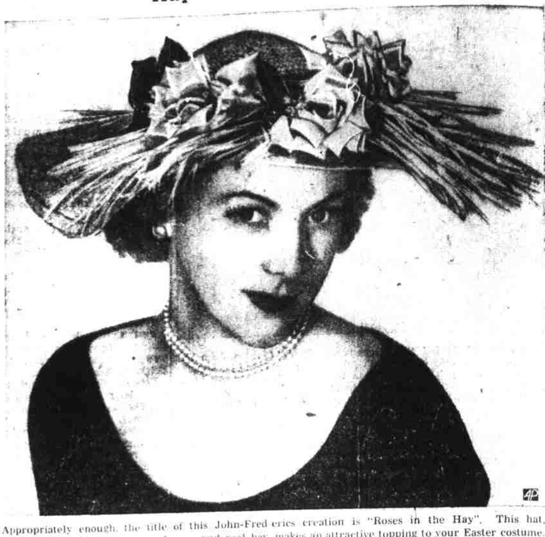
with its big, pink roses, green leaves, and real hay makes an attractive topping to your Easter costume.