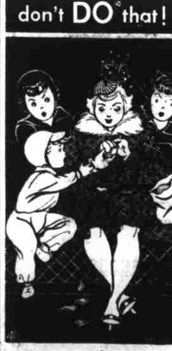
DON'T BE A NUISANCE . It's thoughtless to make a litter in public places, or to eat oderous feeds in public conveyances such as buses.

The moon turns on its axis in the same period (about 27 1-3 days) as that in which it revolves around the earth, so that it always keeps the same face toward us.