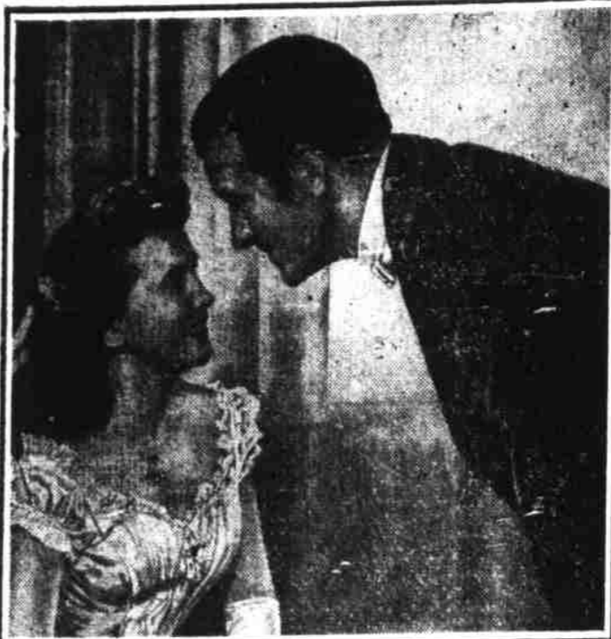
"ENCHANTMENT" starring DAVID NIVEN, TERESA WRIGHT, and EVELYN KEYES opening at the Strand Theatre Sunday.

With less than seven per cent of the world's population, the United States at present is making more than half of the world's steel, says Rep. Clarence J. Brown, Republican, of Ohio.