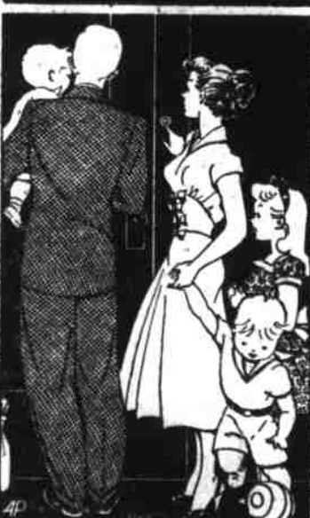
TELEVISION MANNERS... Just because your neighbors have a new set, it doesn't mean that you can drop in at all hours, uninvited.