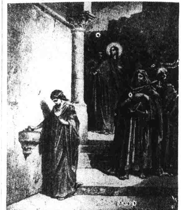
The widow's mite.

"God loveth a cheerful giver."—II Corinthians 9:7.