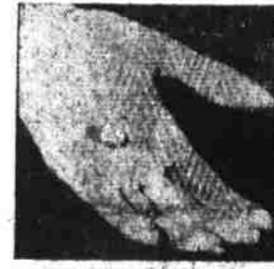
NEW, SAFE, SCIENTIFIC TABLET

No Faster Arthritic Pain Relief Known SAFE...HOSPITAL TESTED Stops Swelling • Uncorks Joints • Contains Sensational New Research Discovery