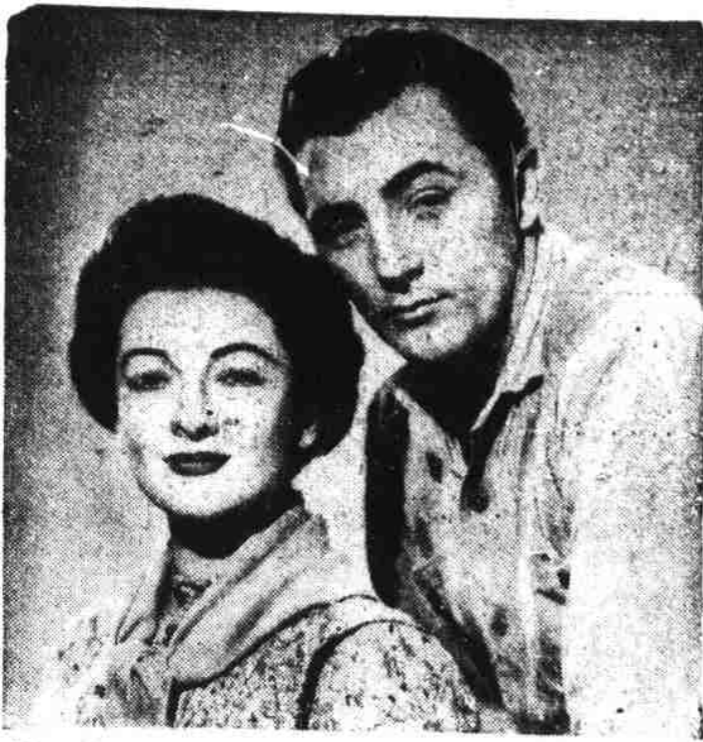
Myrna Loy and Robert Mitchum, stars of the Technicolor production "Red Pony" opening at the Strand Theatre Sunday.