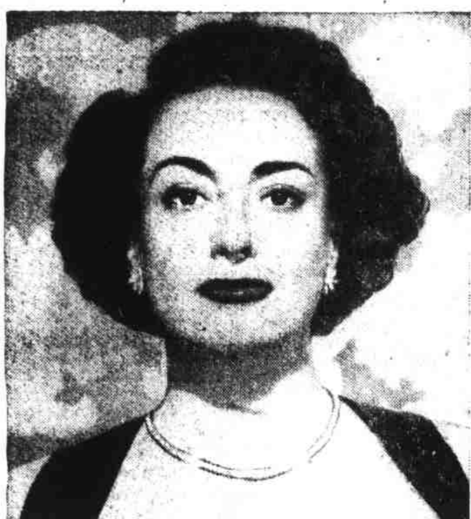
Joan Crawford, as she appears in Flamingo Road, her latest and best picture, which will be shown at the Park theatre on Monday and Tuesday.