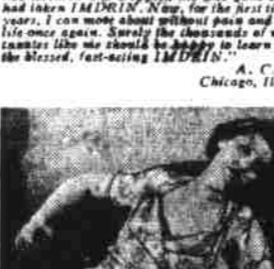
How IMDRIN Helps You!

If you have suffered the tortures of rheumatic or arthritic pains, swelling and stiffness... if you get up mornings dreading the suffering the day may hold, and do it day after day, month after month, year after year... listen! IMDRIN may answer your problem of comfortable living. In case after case IMDRIN has proved its potency. IMDRIN is one of the fastest arthritic and rheumatic pain relievers known to medical science. Cases deemed almost hopeless... persons who suffered and waited and hoped for as long as twenty years were able to live happy comfortable lives once again. No other medication for rheumatism and arthritis can make this amazing statement... and back it up with proven hospital and clinical records. Amazing new IMDRIN brings new hope on a better life for you... and it is as close to you right now as your nearest drug store. Get IMDRIN today! Use only as directed. If you don't agree that amazing, new, scientific IMDRIN is the greatest blessing you've ever discovered, return for your money back. Get IMDRIN today—resume comfortable living tonight!