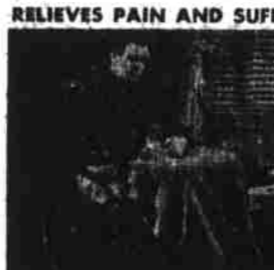
RELIEVES PAIN AND SUFFERING AFTER 20 YEARS OF TORTURE!

Rheumatic and arthritic pain and inflammation strikes any of the indicated areas. (See chart above.) But these diseases have many forms and symptoms. All forms of arthritis and rheumatism are accompanied by pain, very often swelling and loss of function of the joints. Hospital test patients receiving IMDRIN were able to resume more happy active living once the pain subsided and their confidence grew. IMDRIN reduced joint swelling and eased pain rapidly. IMDRIN is your greatest hope. IMDRIN may give you the same blessed results. Get IMDRIN today!