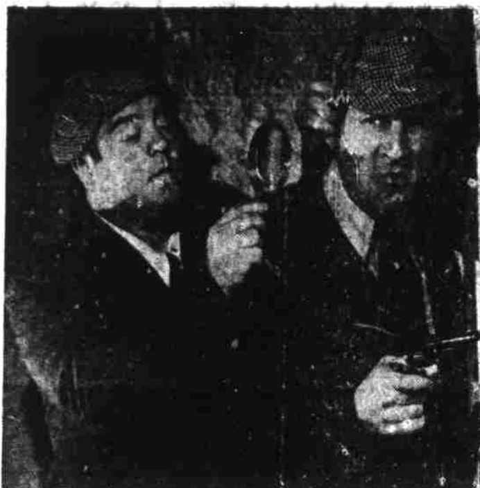
Lou Costello and Bud Abbott in the mystery thriller comedy "Who Done It?" opening at the Strand Theatre Sunday.