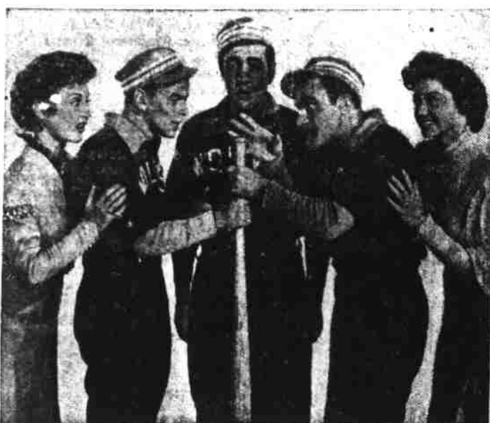
Frank Sinatra, Gene Kelly, Esther Williams, Betty Garrett and Jules Munshin in a scene from the Technicolor Picture "TAKE ME OUT TO THE BALL GAME" playing at The Park Theatre Monday, Tuesday, May 16-17.