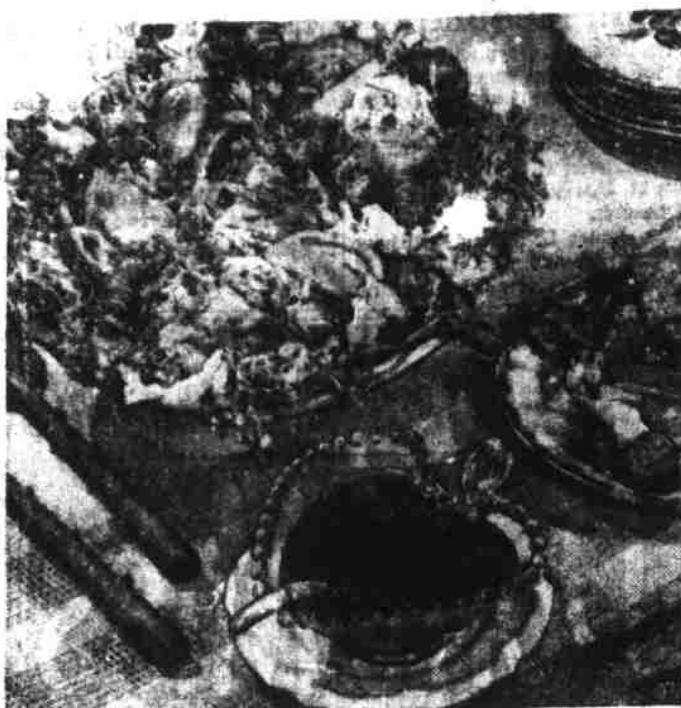
CREAMY FRENCH DRESSING . . . Tops for salad

By CECILY BROWNSTONE Associated Press Food Editor