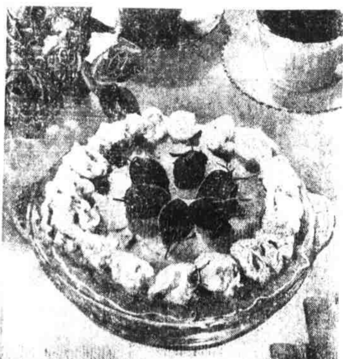
STRAWBERRY PIE Special occasion dessert.

By CECILY BROWNSTONE Associated Press Food Editor