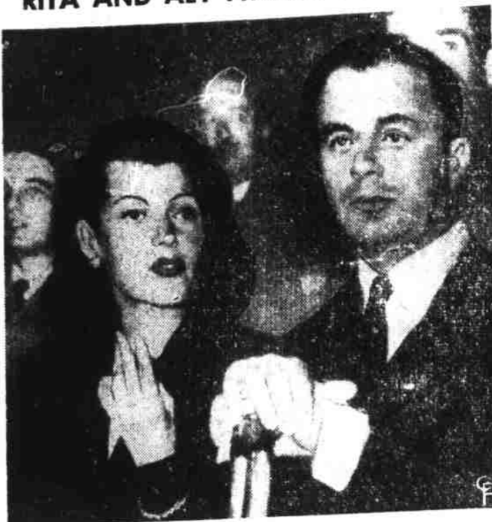
HOLDING CRUTCHES he has been using since he suffered an ankle injury, Prince Aly Khan is shown ringsiding at a Paris bullfight with his bride-to-be, screen beauty Rita Hayworth. The well-known designer Jacques Fath, is now working on the actress' trousseau.