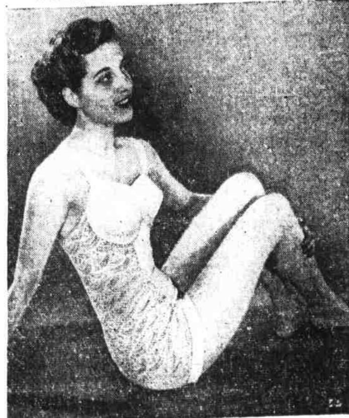
This intriguing maillot designed by Margaret Newman has side panels of lace over nylon marquisette. The rest of the suit is white waffle pique, and it comes with dramatic matching mandarin beach coat with wing sleeves and a flaring back.