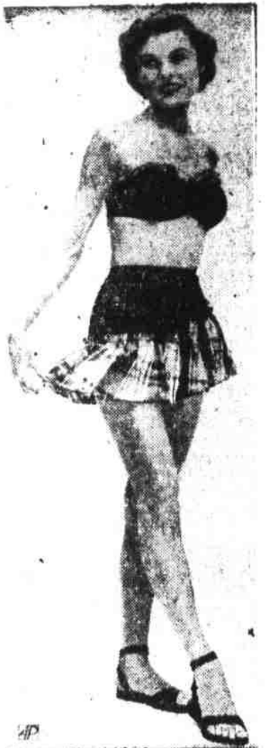
This two-piece satin lastex suit designed by Brilliant is trimmed with plaid taffeta ruffles. Strapless bra is wired.