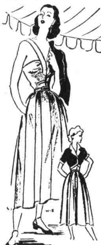
Pink cotton sun dress.