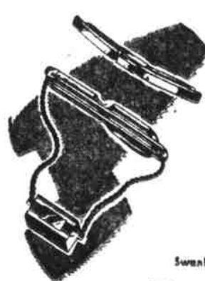
NEW EXPANSION WATCH BRACELET