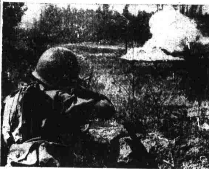
READY TO PULL THE TRIGGER, a Marine infantryman holds his rifle to his shoulder as he waits for the "enemy" to emerge from a bunker fired by a flame thrower during a demonstration at Quantico, Va. The display of fighting tactics was put on for visiting congressmen.