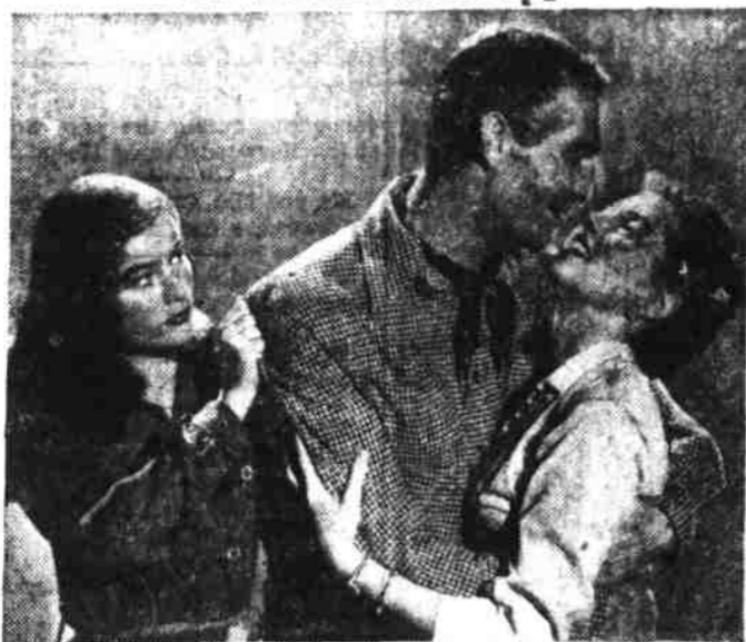
Randolph Scott in "Canadian Pacific," Color by Cinecolor. Also featuring Jane Wyatt, Nates Owen and J. Carroll Nash. Opening at the Strand Theatre Sunday.