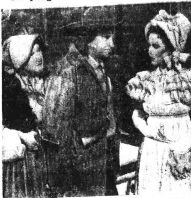
Wallace Beery as he appears in his last picture, "BIG JACK," with Marjorie Main and Vanessa Brown. This picture just finished before his death. It is a comedy drama of the pioneer days, and is being shown at the Park Theatre Sunday, May 29th.