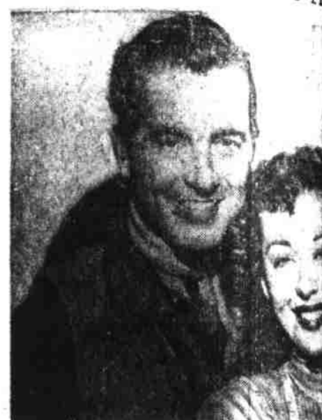
John Payne and Gail Russell as they appear in the spectacular color Western Drama "El Paso" playing at the Park Theatre, Thursday and Friday, this week.

It is estimated that recreational areas and facilities in the 151 U. S. National Forests will receive more than 27 million individual visits this year.