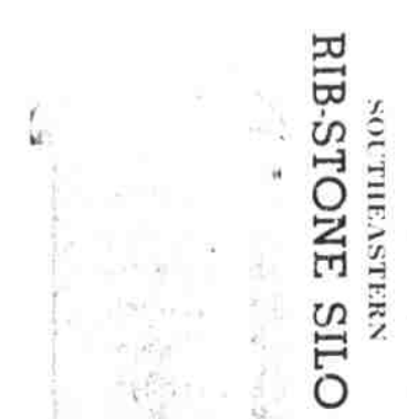
SOUTHEASTERN RIB-STONE SILO

therefore a chick starter should not be used. Most poulters will start to eat and drink right away, but there are occasional groups that need to be helped. Many "tricks" have been used to teach poulters to eat. Bright glass marbles may be placed in the water and on the feed; crumpled oat meal, short chopped grass, or finely cracked yellow corn may be sprinkled over the feed. Water in glass jars will be emptied twice as fast as water in other containers of equal size, because the poulters are attracted by the bubbles arising in the jar and by its brightness. A strong electric light placed directly over the feeders and waterers will increase consumption. In some cases, poulters may be taught to eat and drink by dipping their beaks in mash and water. Usually only a few in a group need to be taught, but in some cases nearly all do, and for this reason some growers dip the beak of each poult into feed and water as it is taken out of the box. The longer the poult goes after hatching without water and feed, the less likely it is that it will learn to eat without help.