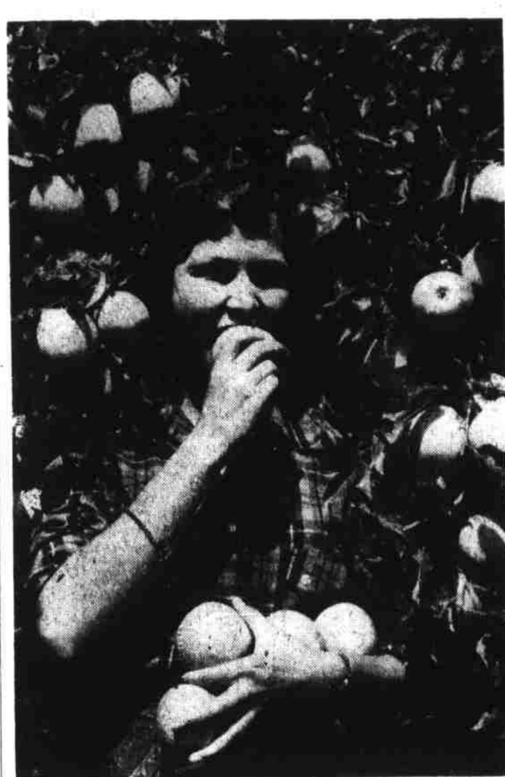
Haywood apples are known far and wide for their distinctive flavor and are in demand on the leading apple markets of the country. Some like them right off the tree as this young lady.

Fruits and vegetables grown in Haywood represent a cash income of about $750,000, according to records of the department of agriculture. This figure is about 14 per cent of the total cash income of five millions for Haywood.