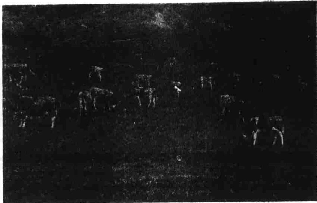
This herd of cows are making money for their owners. The pasture has had good care, and reflects the attention given in the profit from milk.