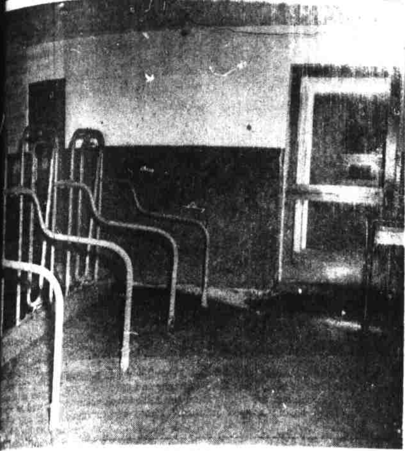
The new dairy has been completed by Robert Underwood, in East Waynesville, N.C. The building has three departments, a milk room, milking room with automatic milking machine which is made especially for interior of dairy barn, and a cheese room. The color scheme of painting was used, white and buff-tinted. Bill Ingram outlines the barn.