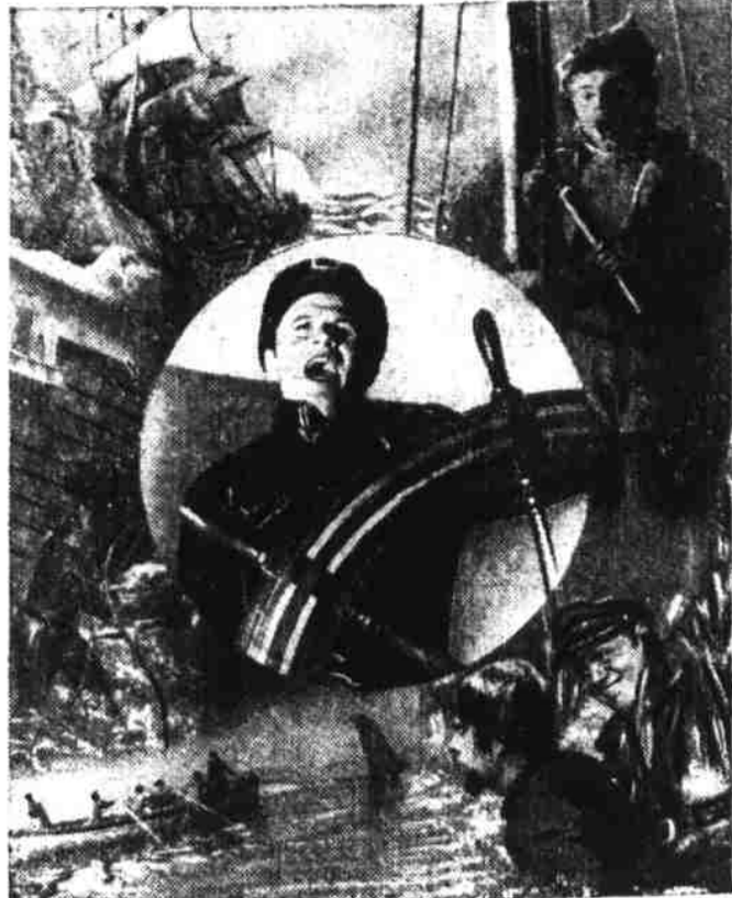
Action and adventure fill the screen in the thrilling new Twentieth Century-Fox film, "Down to the Sea in Ships," which stars Richard Widmark, Lionel Barrymore and Dean Stockwell opening at the Strand Theatre tomorrow.