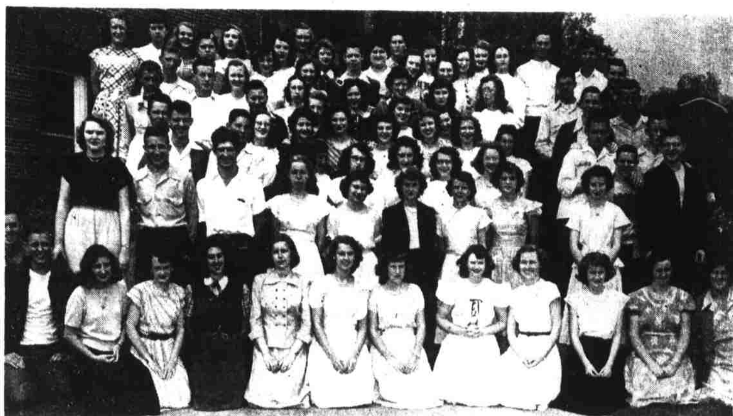
Shown above are the 79 students in the 1949 graduating class at the Canton High School. Graduation exercises will be Monday night, June 6.