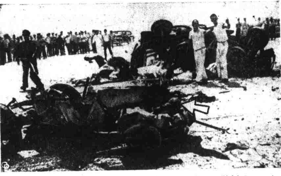
ANOTHER SACRIFICE TO RACING, three men were killed when two "hot-rod" cars collided during a race in Victorville, Calif The arrow points to one of the victims still pinned in the wreckage. The crash was witnessed by 1,000 spectators who fined the course on the El Mirage Dry Lake timing speedway.

THREE DIE IN CALIFORNIA 'HOT-ROD' RACE CRASH