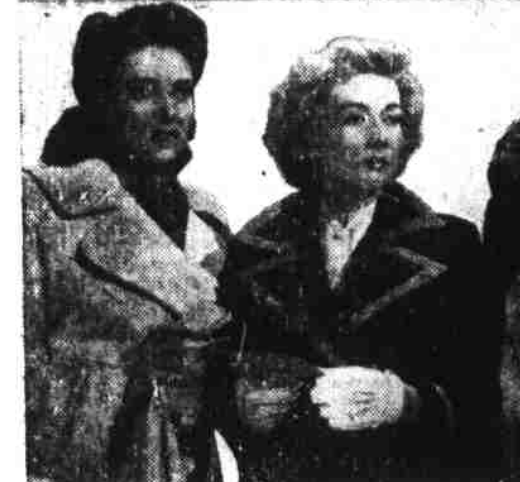
Linda Darnell, Ann Sothern and Jeanne Crain starred in "A Letter to Three Wives," also starring Paul Douglas, Kirk Douglas and Jeffrey Lynn. Opens at the Strand Theatre Sunday.