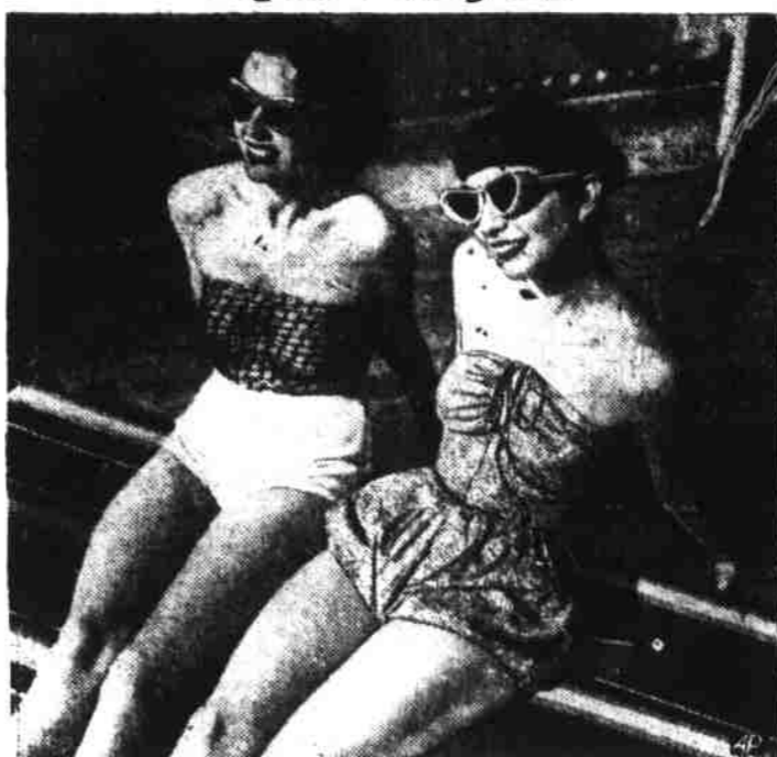
The piquant note in the glasses worn by the model on left is the simulated elevated eyebrow effect, side bars and suspension line bound in rattan. (Right) Cosmetan glasses with visor top, cheek guards in yellow.

By BETTY CLARKE AP Newsfeatures Beauty Editor