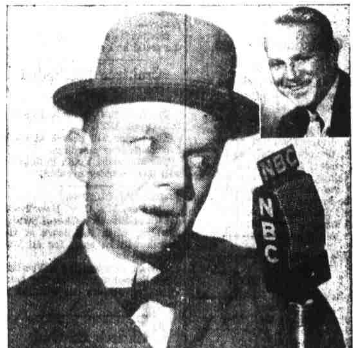
The comedy star of "Plantation House Party," the one and only DUKE OF PADUCAH, known as the Ding Dong Daddy of the homespun humorists. He's a humdinger.