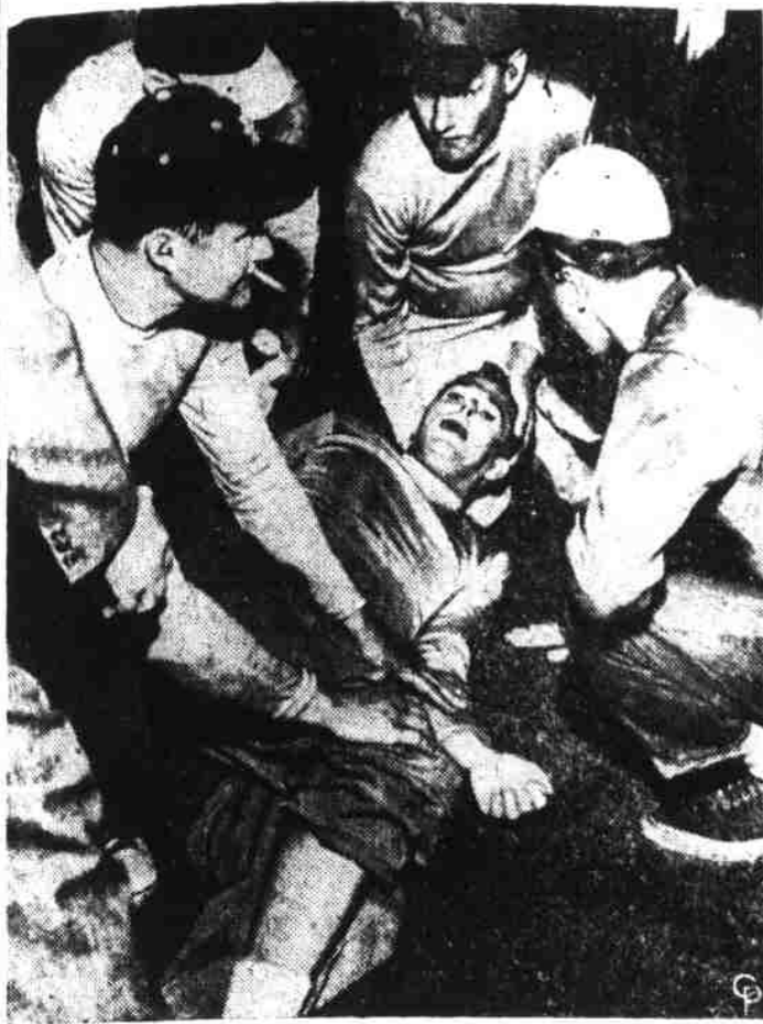
INJURED WHILE SLIDING into first base, film star Ronald Reagan is surrounded by fellow players on Wrigley Field, Los Angeles, where the movie actors held their "world series" game. He was removed on a stretcher. It was later reported he had strained a ligament in his leg and would not be able to walk for several weeks.