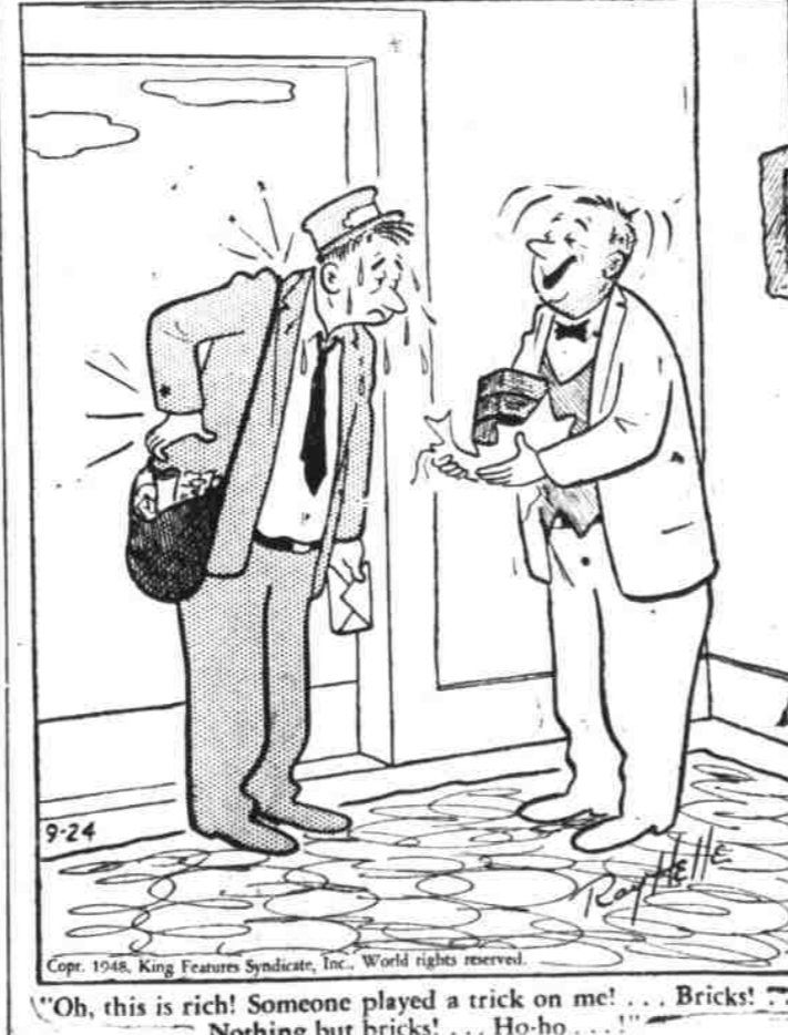
9-24 Copr. 1948, King Features Syndicate, Inc., World rights reserved.