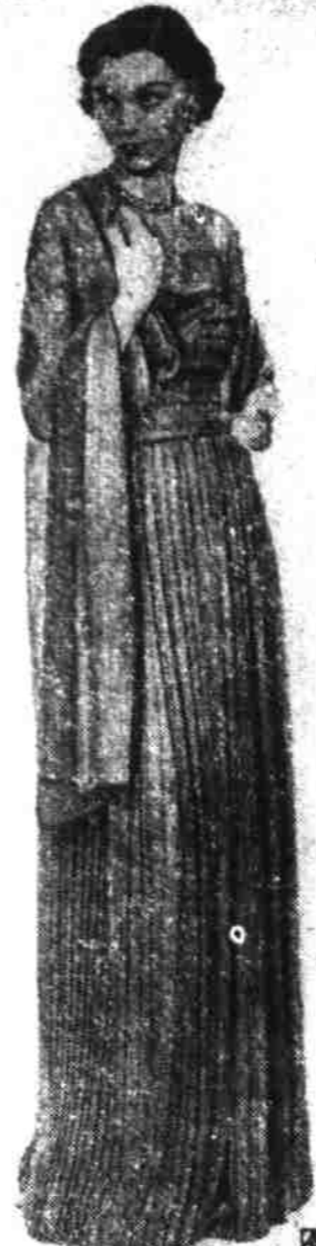
This chiffon evening gown is a nice project for home seamstresses (Advance pattern 54).