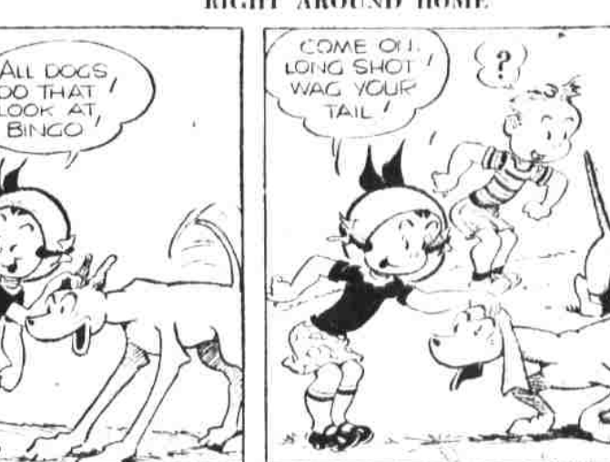
RIGHT AROUND HOME