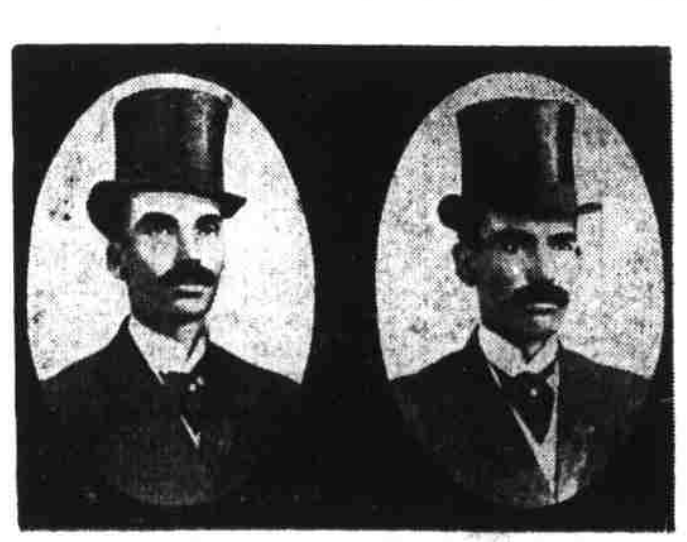
Sale Conducted by

David Underwood farm in Ninevah section. 84 acres of crop and grass land, some of Haywood's best grazing grass. 12 acres tobacco allotment, corn and other crops planted. Good tenant house, lights and water, large barn. Only one mile from Main Street on good road. Be on ground. Buy this excellent farm.